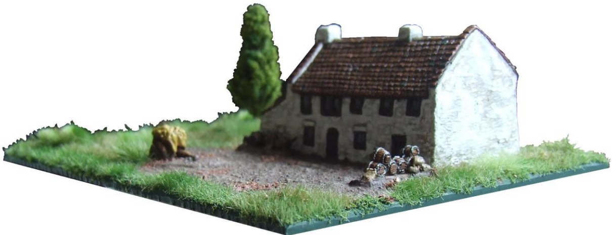
The rear of the inn.

6 companies of musketeers (8 bases of trained line infantry) 1 company of grenadiers (8 bases of elite line infantry) 1 company of skirmishers (8 bases of trained skirmishers) 1 squadron of Dragoons (7 bases of heavy horse) 3 commander bases